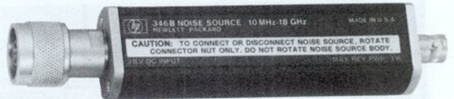
346B (option 001)