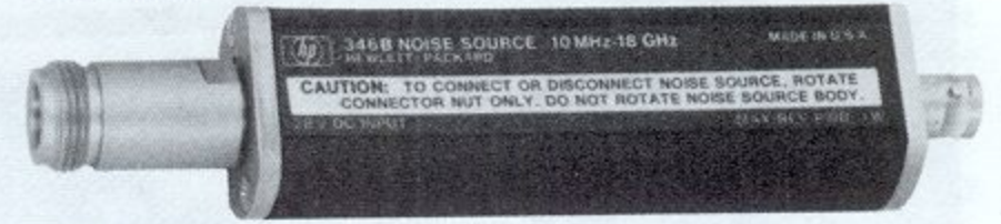
346B (option 004)